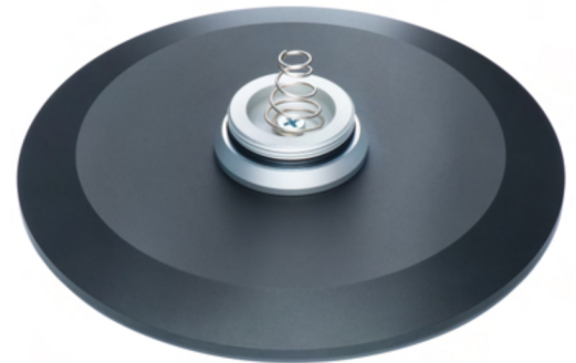
Base with rubber cap removed: